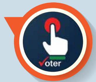
Voter Helpline App

Register online or verify your details at voters.eci.gov.in